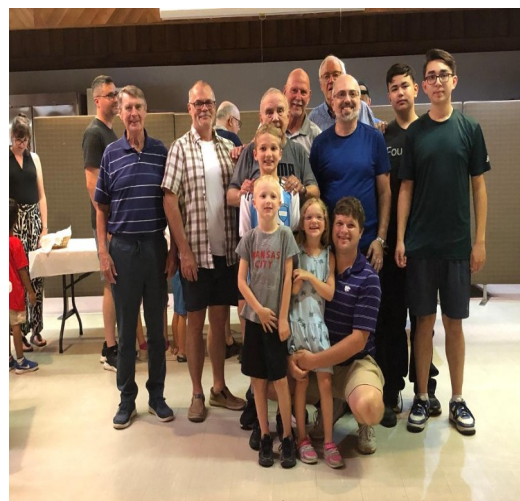
The Fabrique members

Over 60 parishioners and friends gathered in the Olga McCormack Hall on Saturday August 26 th for St. Augustine's annual BBQ and corn roast. After expenses, there was a net profit of $400 which will go towards parish operational costs. Thank you to all our dedicated volunteers and everyone who joined us!